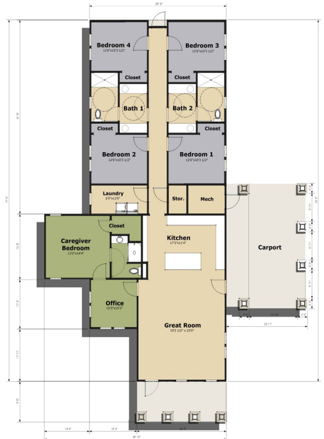
Proposed Exterior and Floorplan