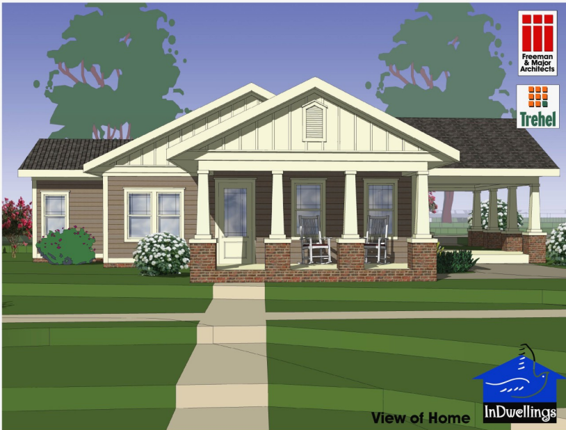
View of Home

Building Homes of Love – A Ministry of Foothills Presbytery For Special People with Special Needs